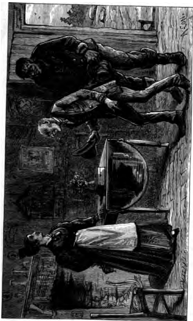
Unwelcome Visitors.—p. 48